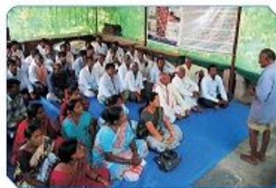
Exposure visit to Visundra Farm house, KDP, Karnataka