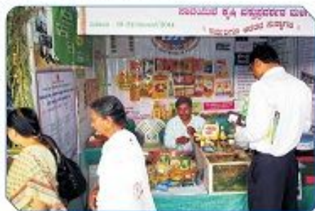
Farmers - Value added products at Kurishi Mela, Bangalore

There are success stories of farmers adopting a new package of practices. These practices have created a real change from the chemical based agri-operation. Unfortunately, a sizeable number of farmers despite their good efforts could not get proper yield due to the failure of monsoon. Even the early monsoon period for the financial year 2015-2016 has not given any cheer to farmers for the season. DPG helped a few farmers from Chikaballapur district to participate in Sales cum Exhibition organised by Government of Karnataka and University of Agriculture at Gandhi Krushi Vigyan Kendra (GKVK), Bangalore to display the organically produced pulses, millets and vegetables. We helped a few SHG members from Chennai to participate in a Healthy Living Exhibition organised by Trade Centre at Chennai. The exhibition displayed to the public, the Value Added Products produced by them with the help of local entrepreneurs.