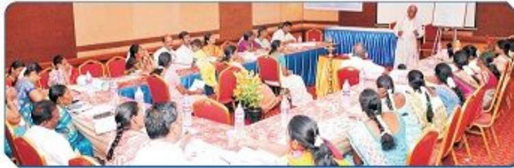
Partners meet at Madurai 4th to 6th February 2015